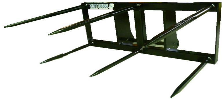
DOUBLE BALE SPIKE